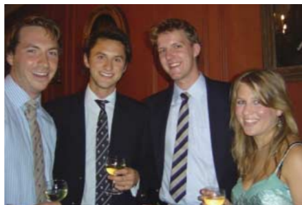
OP Dinner – September 2006